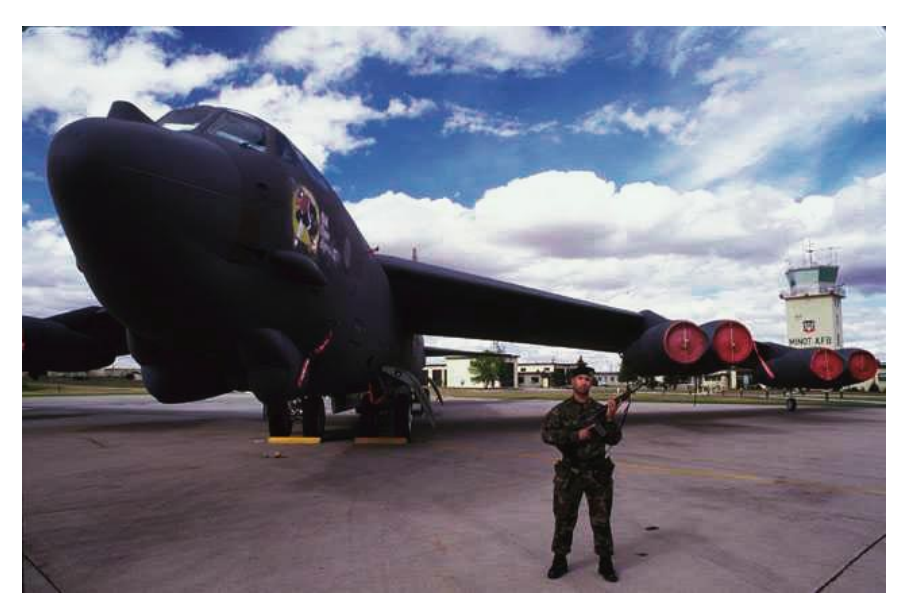
Security forces protect nuclear weapons and delivery systems.

until an authorized code has been entered. They may also involve personnel monitoring systems, such as the Personnel Reliability Program or the Two-Person Concept. Commanders are responsible for ensuring that appropriate systems are in place, as described by appropriate Air Force policies.