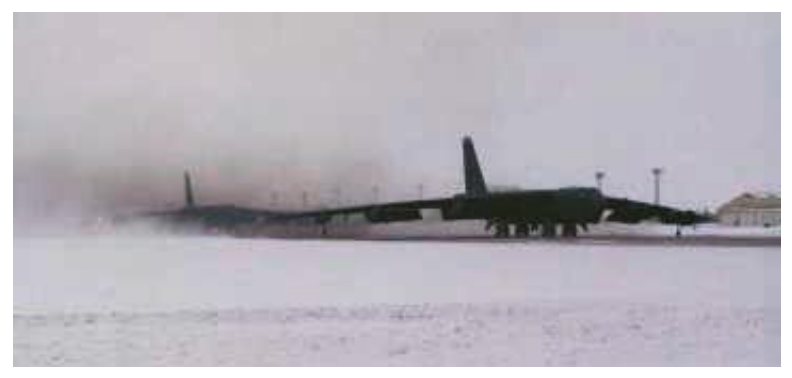
B-52s perform minimum interval takeoffs in response to tactical warning.

possible that communications may be degraded to the point that it is difficult to pass critical information or send orders to the field.