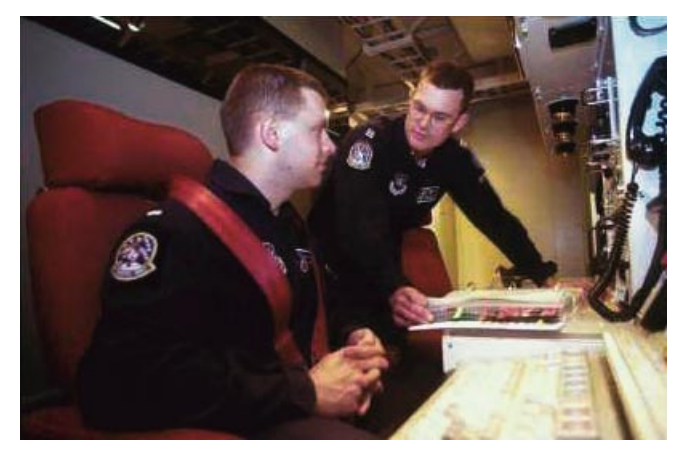
Simulators are a useful tool for both initial and recurring training.

nuclear operations, crew members often will not have the time to read through manuals and policy documents, so in-depth EAP-STRAT training is critical.