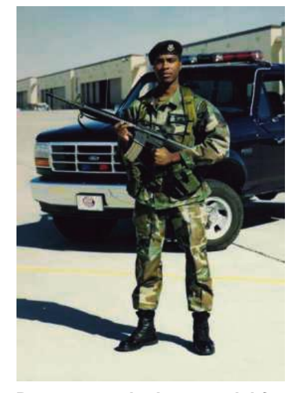
Proper security is essential for maintaining WSSRs.

implemented WSSRs are through a combination of mechanical means, security procedures, flying rules, and personnel programs. Different weapon systems will have different rules based on their capabilities. Storage and movement of weapons must also be consistent with WSSRs. Commanders and operators must follow applicable Air Force policies for their weapon system and must ensure that non-US personnel adhere to applicable Air Force and multinational requirements. One key component of WSSRs is that, while preventing the unauthorized use of nuclear weapons, they allow for timely employment when ordered. To this end, all personnel involved in the com-