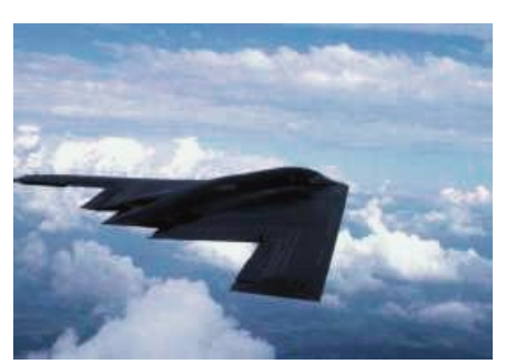
Bombers like the B–2 give decision makers more flexibility.