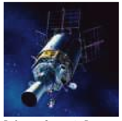
Defense Support Program satellites provide early warning of a missile attack.

to gather information and make decisions in a timely fashion. Warning systems must be in place that allow civilian leaders to determine if a nuclear response is appropriate. Planners must have the means of finding decisive targets and determining the proper weapon to employ. Post-attack assessment of both friendly and enemy capabilities is essential for determining the need for and ability to conduct follow-on attacks.