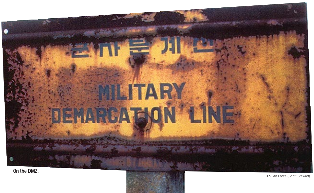
On the DMZ.