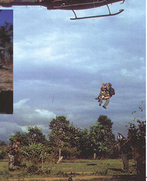
Comhat Camera Center (Andv. Di